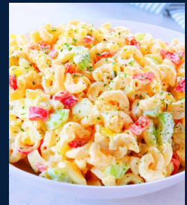
Classic Macaroni Salad